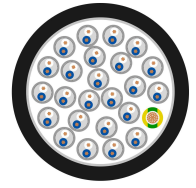
Abb. dntch | Pg. smkr